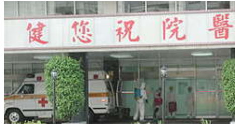
A SARS HOSPITAL IN CHINA

FROM ITS EARLY DAYS, the medics recognised that this was not another form of Asian Influenza, nor was it the usual pneumonia, although it resembled both. This was a brand new, mysterious and highly contagious respiratory disease that could potentially produce an enormous worldwide epidemic reminiscent of the Spanish flu epidemic of 1918-19 that killed more than 20 million people.